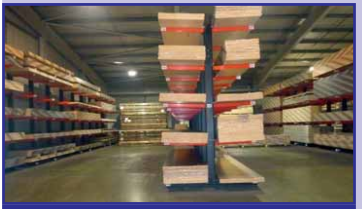
Cantilever racking for the storage of kitchen worktops.

Cantilever Racking provides the ideal solution for storing long items. The rack is designed to cater for the product to be stored. Any height, any length, with arm capacities to suit.