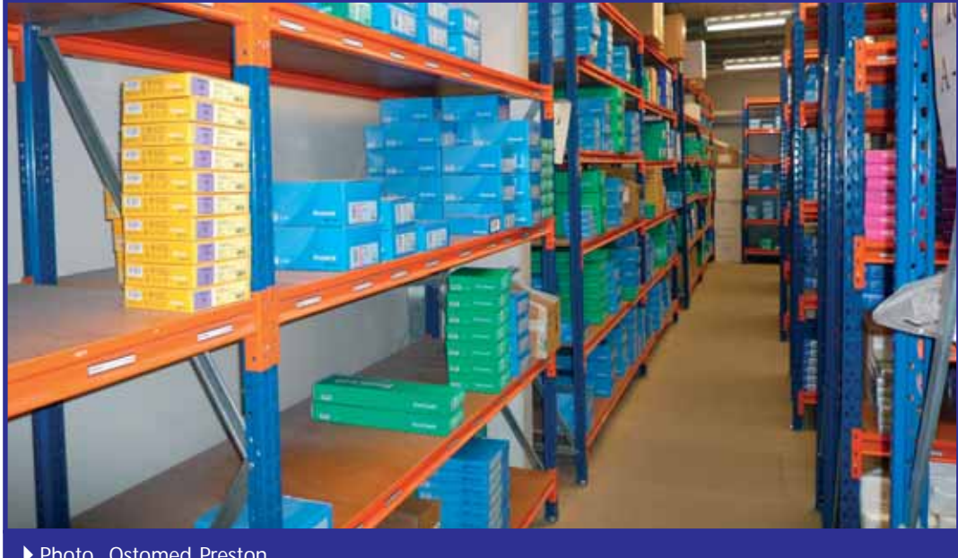
A large longspan installation for storing medical supplies (Note: Melamine faced chipboard shelves).